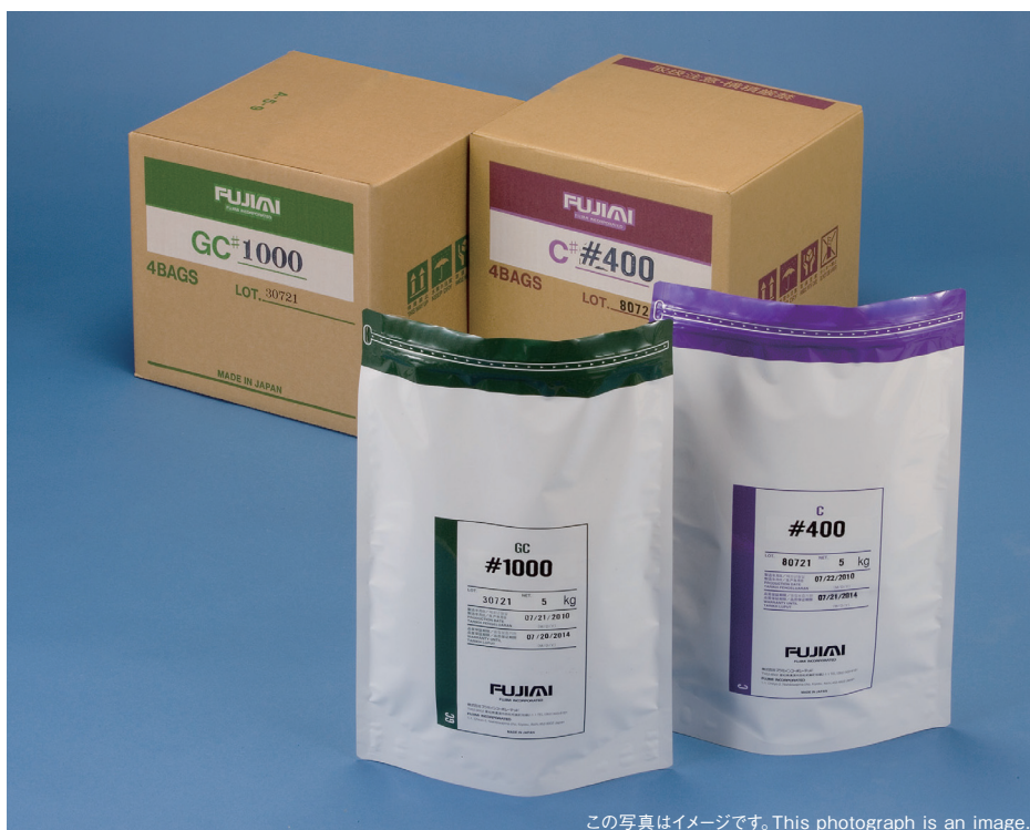
この写真はイメージです。This photograph is an image.